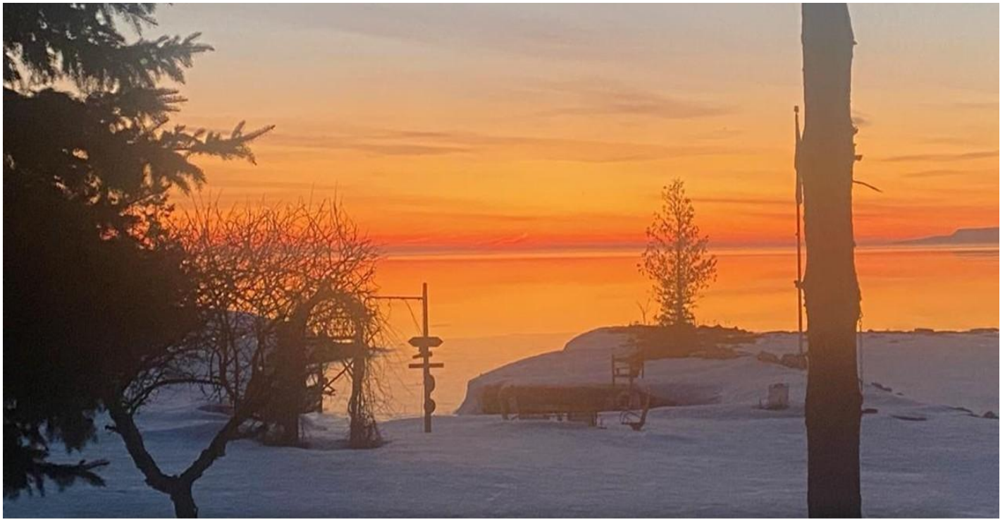
Beautiful Winter View