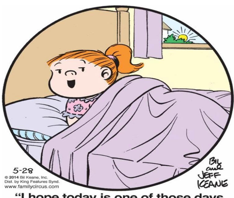
"I hope today is one of those days I never wanna forget."